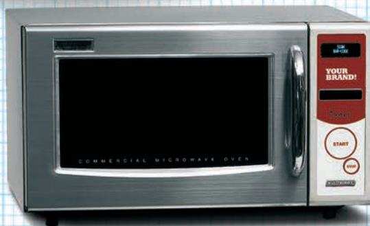
Bespoke design service