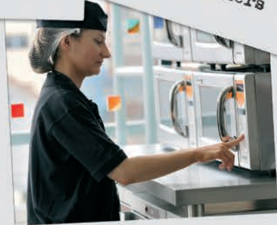
3 million hospital meals served and counting...