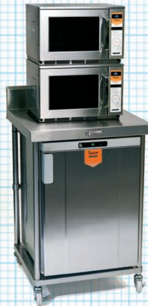
TYPICAL MOBILE SYSTEM TROLLEY