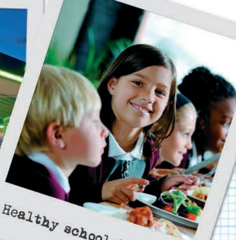
Healthy school dinners