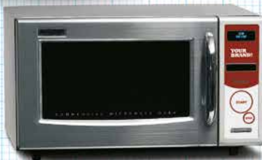
Bespoke design service