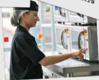
3 million hospital meals served and counting...