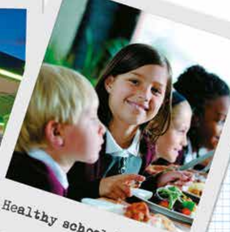
Healthy school dinners