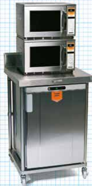
TYPICAL MOBILE SYSTEM TROLLEY iWave/Simply Stainless mobile system bench Carbon Trust (ETL) approved freezer/refrigerator